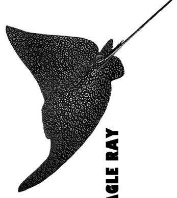
SPOTTED EAGLE RAY