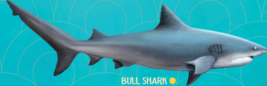
BULL SHARK CARCHARHINUS LEUCAS