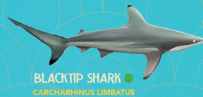
BLACKTIP SHARK CARCHARHINUS LIMBATUS