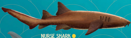
NURSE SHARK GINGLYMOSTOMA CIRRATUM