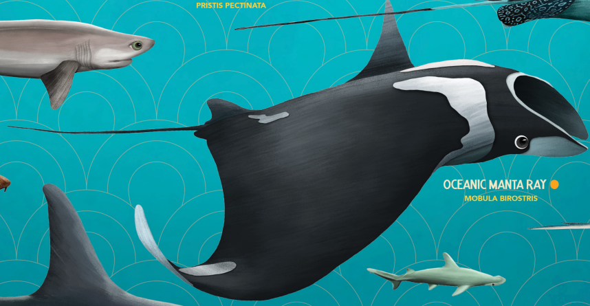
OCEANIC MANTA RAY MOBULA BIROSTRIS