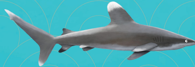
OCEANIC WHITETIP SHARK CARCHARHINUS LONGIMANUS