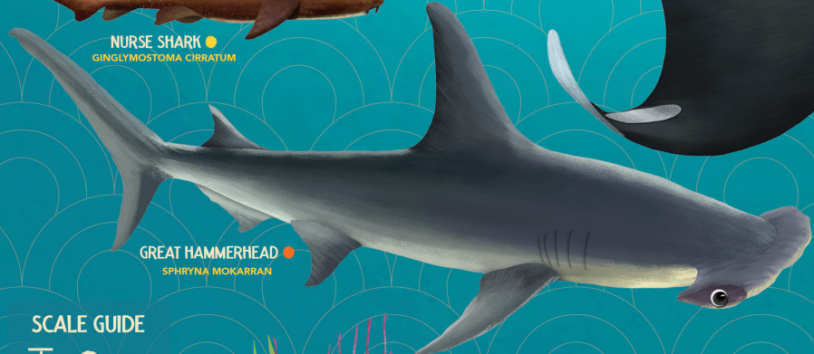
GREAT HAMMERHEAD SPHYRNA MOKARRAN