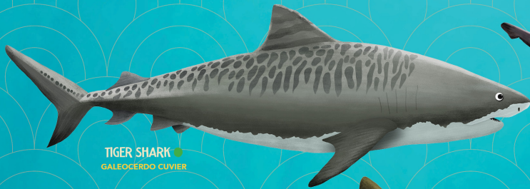
TIGER SHARK GALEOCERDO CUVIER