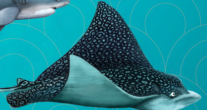
SPOTTED EAGLE RAY AETOBATUS NARINARI