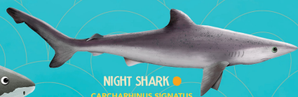
NIGHT SHARK CARCHARHINUS SIGNATUS