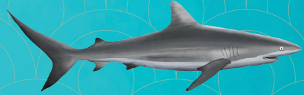
CARIBBEAN REEF SHARK CARCHARHINUS PEREZI