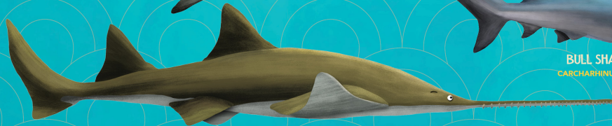
SMALLTOOTH SAWFISH PRISTIS PECTINATA