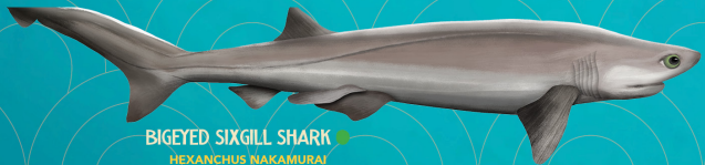
BIGEYED SIXGILL SHARK HEXANCHUS NAKAMURAI